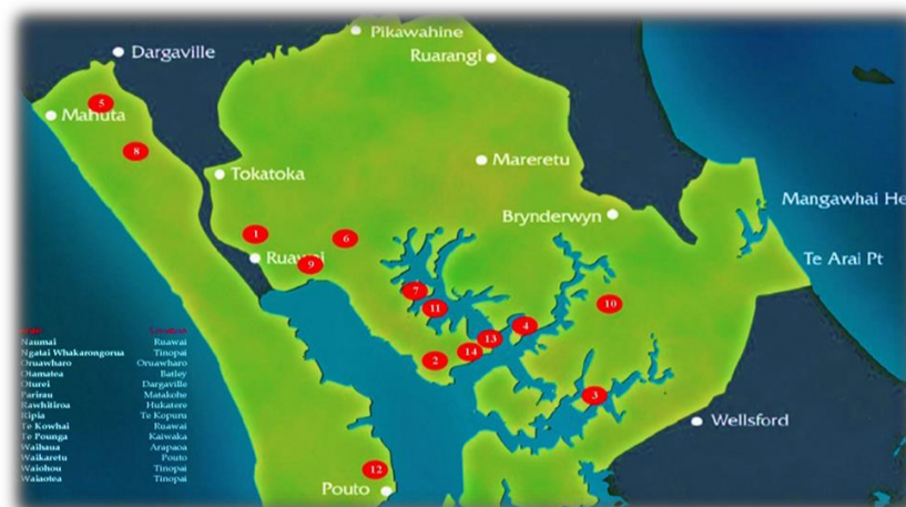
TABLE 3.5 | NGA MARAE O TE URI O HAU